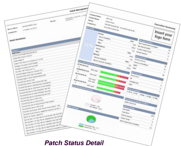
Patch Status Detail Server Health Report