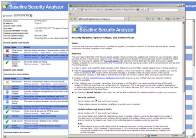
Microsoft Baseline Security Analyzer Report